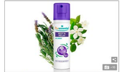
The essential oils in Puresential Rest & Relax Air Spray could help you drift off into a peaceful slumber

There's nothing worse than lying awake, struggling to sleep.