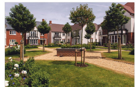
Inspired Villages is synonymous with luxury, choice and reassurance

TRY IT: With a host of fantastic move-in packages, an Inspired Village apartment has never been easier to obtain! Click here for more details or call 0800 331 7430.