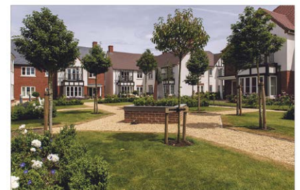
Inspired Villages is synonymous with luxury, choice and reassurance.

TRY IT: With a host of fantastic move-in packages, an Inspired Village apartment has never been easier to obtain! Click here for more details or call 0800 331 7430.