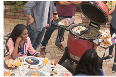
Kamado Joe grills offer versatile, quality cooking outdoors, thanks to their innovative designs

Ah, British summers – you just can't beat them. And what better way is there to celebrate the country's greatest season than to fire up the BBQ?